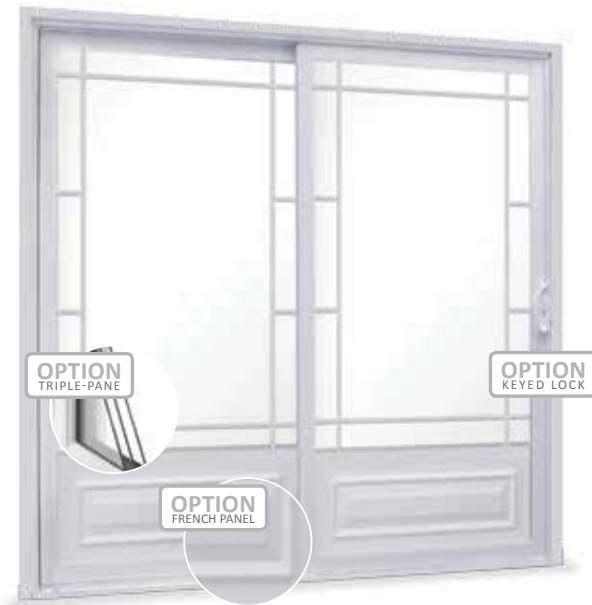
3 X 6 STANDARD GRILLES PERIMETER GRILLES WITH FRENCH PANEL *French Panel may not be exactly as shown

+ We can custom order patio doors to suit any style. Speak with your sales associate for more information.