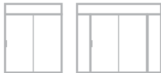
AVAILABLE WITH CUSTOM CONFIGURATIONS